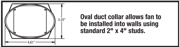
Oval duct collar allows fan to be installed into walls using standard 2" x 4" studs.

Plastic collar for 4" duct connection, comes complete with built in non-metallic back draft damper for quiet operation. Oval design accepts standard 4" round ducting and fits into standard 2" x 4" walls.